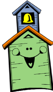
At our Church this week...